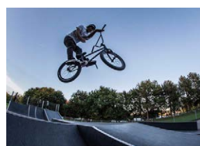
NEW CHALLENGES AND AN INSPIRING COMMUNITY SPACE