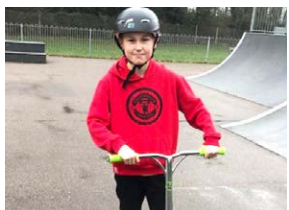
IMPROVED FITNESS, MENTAL HEALTH & ENTERTAINMENT