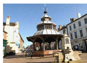
N. WALSHAM TOWN CENTRE