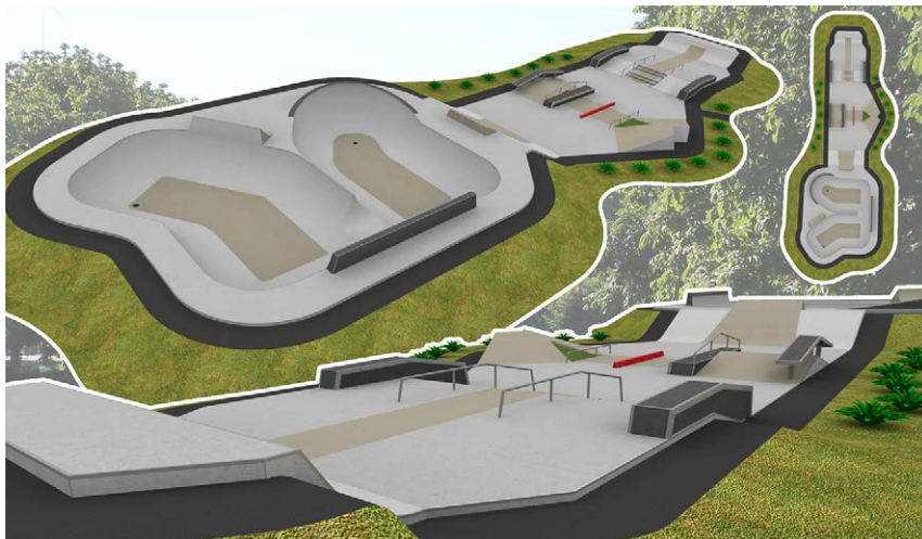
THE NEW SKATE PARK IS DESIGNED FOR ALL RIDERS OF DIFFERENT NEEDS, ABILITIES & SKILLS