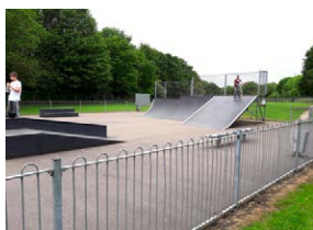
N. WALSHAM SKATE PARK

North Walsham is the largest town in the district of North Norfolk, with some 13,000 residents (as recorded by Nomis, 2017). Of this figure, some 30% are aged 30 or below and are the key demographic this project hopes to primarily support.